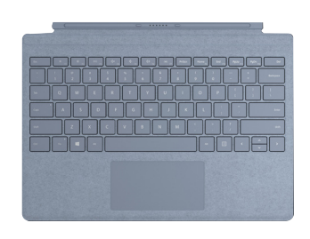
Surface Go Type Cover

Pair the Surface Go 3 with these accessories: